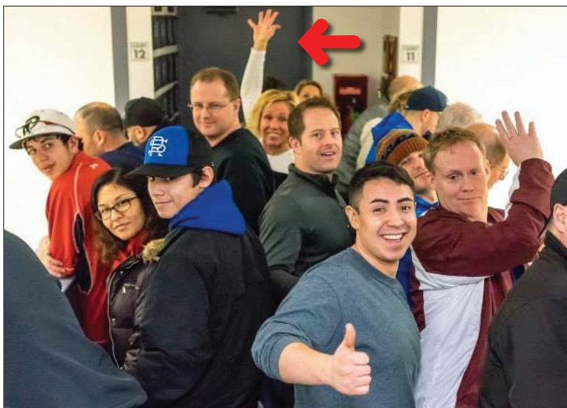
Racquetball Fans are The Best!