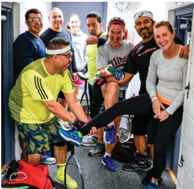
A Rowdy Crowd in the Hallway!