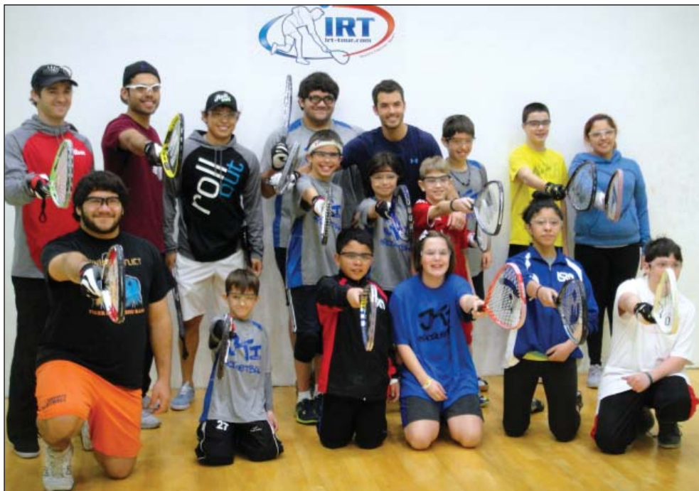
The Junior Clinic was well attended and enjoyed by all!