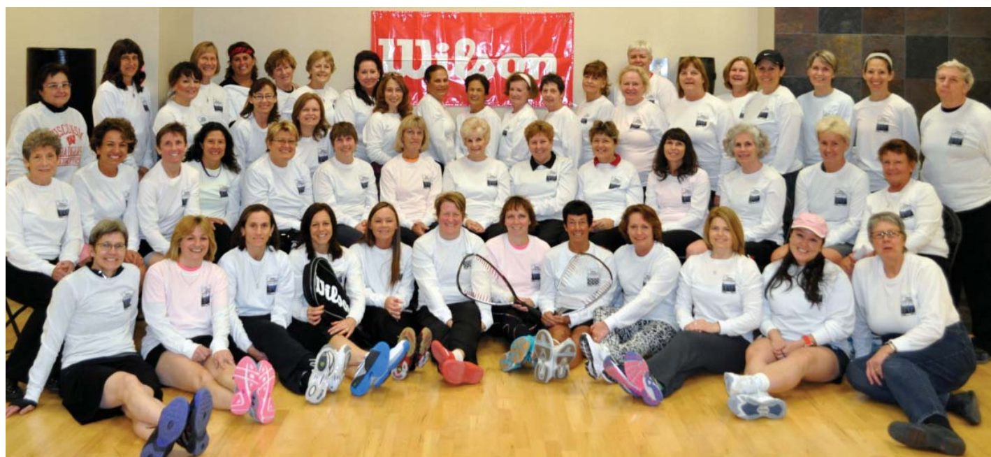
WSMRA Players – January 2015