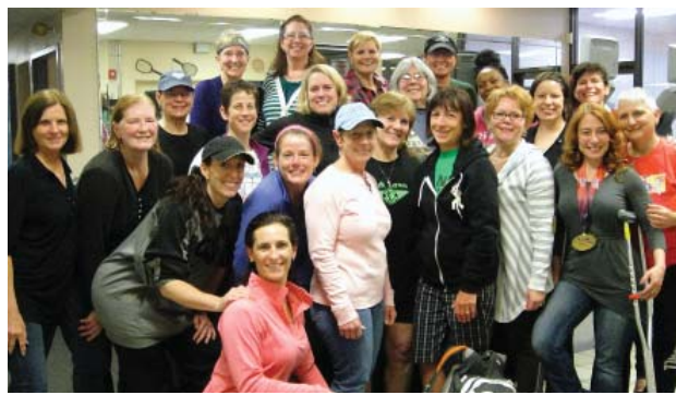
2014-15 Women's Travel League