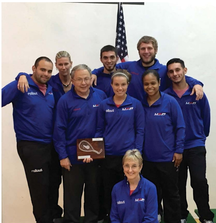
Team USA competed in Santo Domingo to earn spots in Toronto