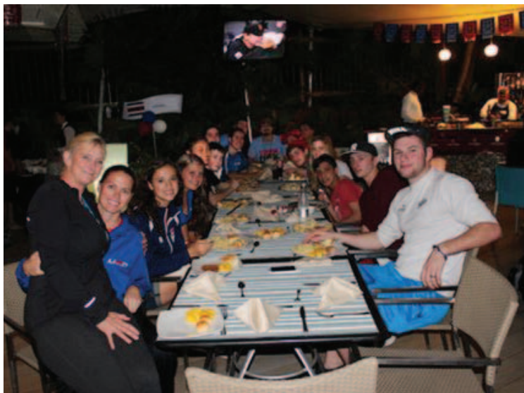
US Junior Team enjoys dinner courtesy of Team Illinois