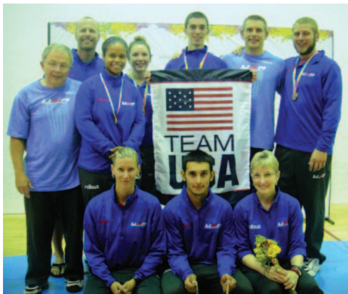
Huff and Kirk accompanied the US Team to Guadalajara

138 players 10 countries: Argentina, Bolivia, British Virgin Islands, Canada, Guatemala, India, Italy, Mauritius, Mexico, United States 17 U.S. States 18 divisions