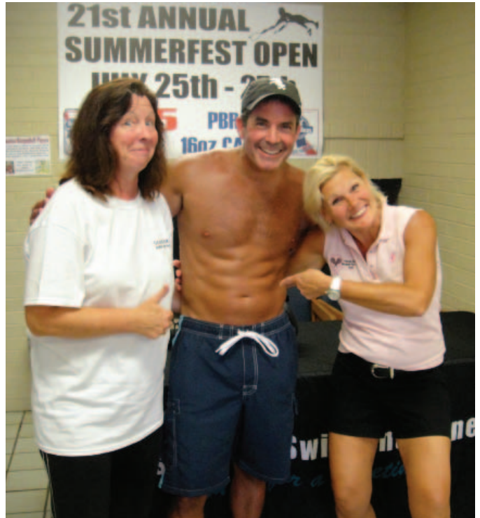
This guy wandered in from the pool...