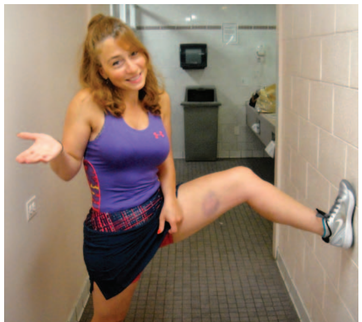
Okay, THAT's a hard hit!