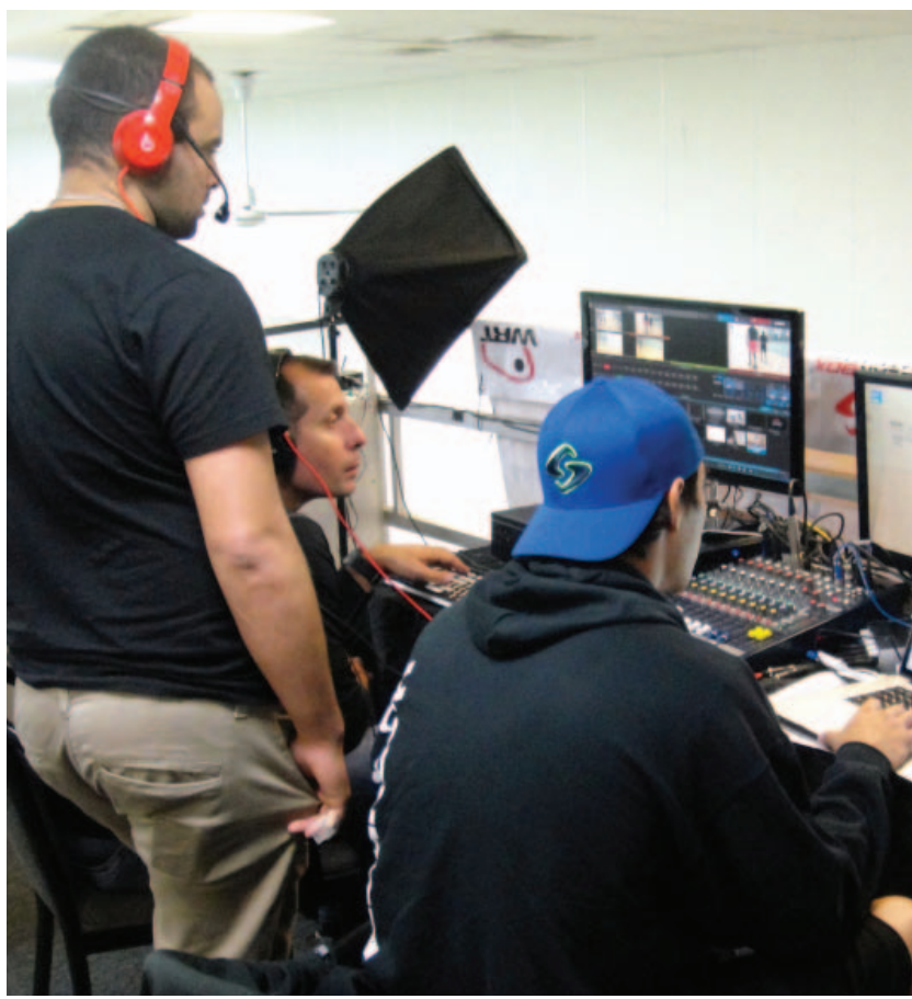
WRT streamed from the balcony above the glass court