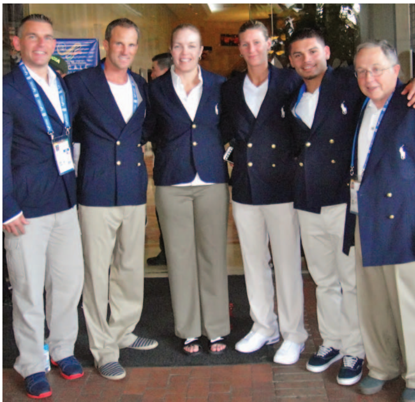
U.S. Delegation to the World Games

It's always great to see the U.S. come out on top, but this time it wasn't to be.