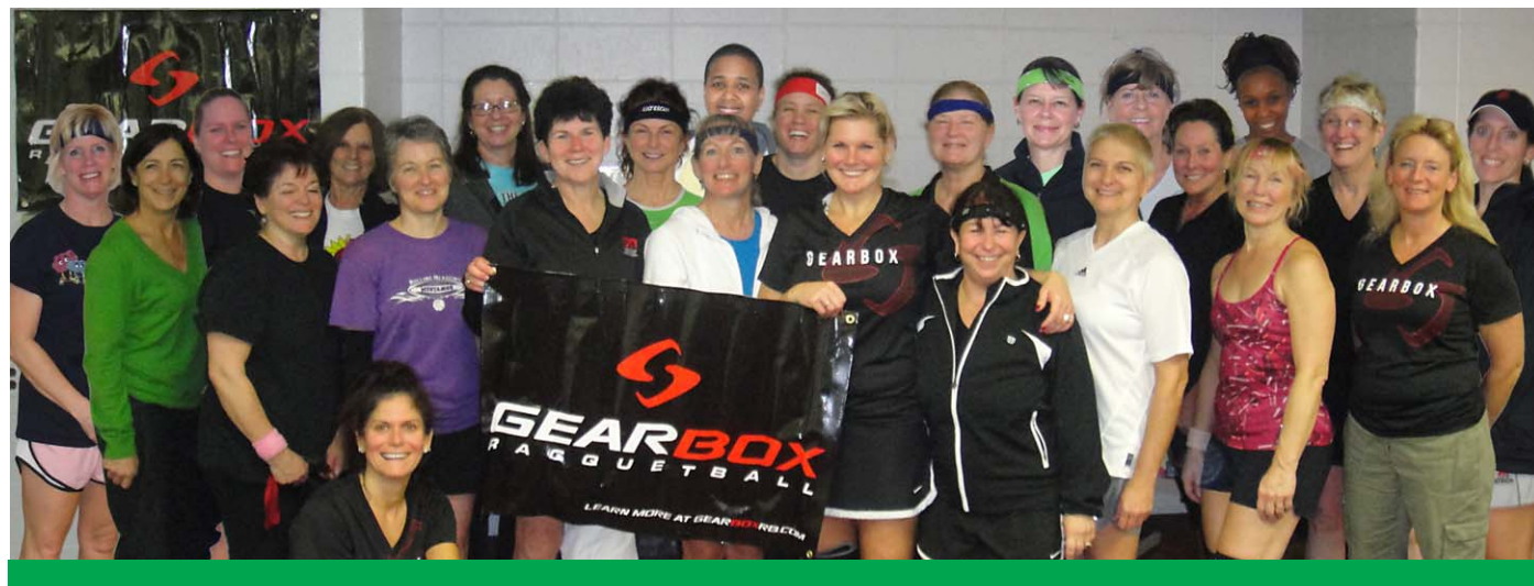
All 25 players in one shot? How did that happen??