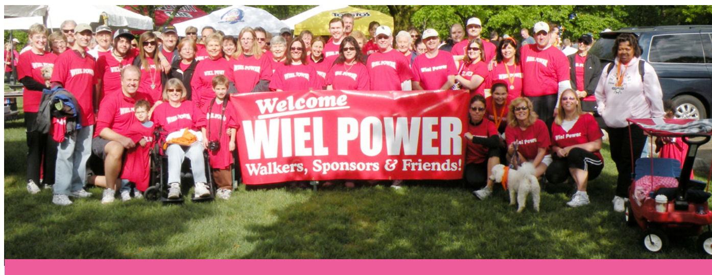
Wiel Power was out in force this gorgeous spring day