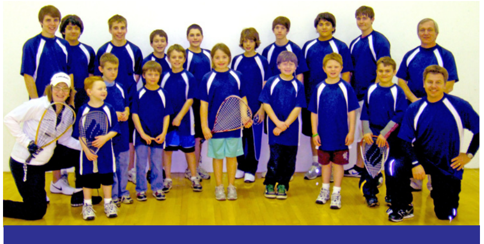
Season-end pizza party had a great turnout!