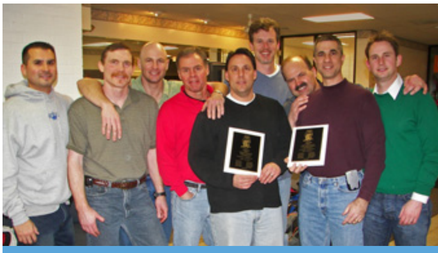
A/B Division — LA Fitness Naperville