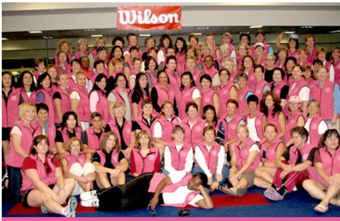
WS/MRA Ladies in California — That's a Lot of Pink!