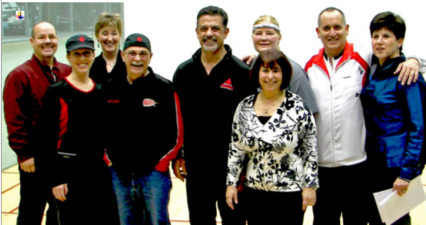
ISRA Board and Auxiliary Board members at the Annual Awards