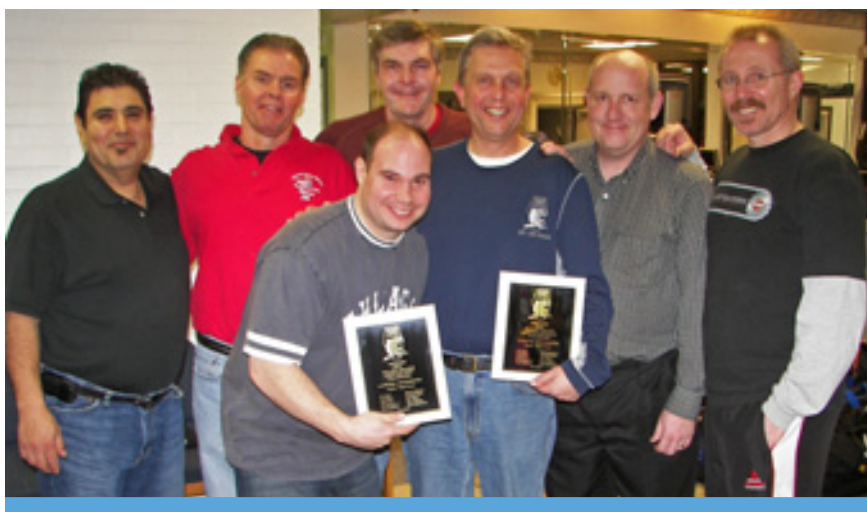
B/C Division — LA Fitness Bolingbrook