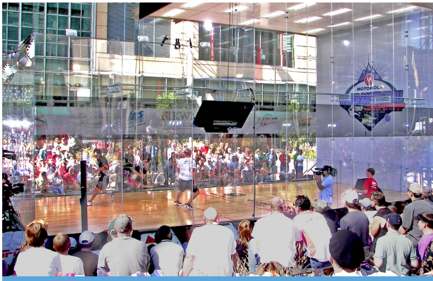
Spectators crowded around to view the history-making IRT action in Denver