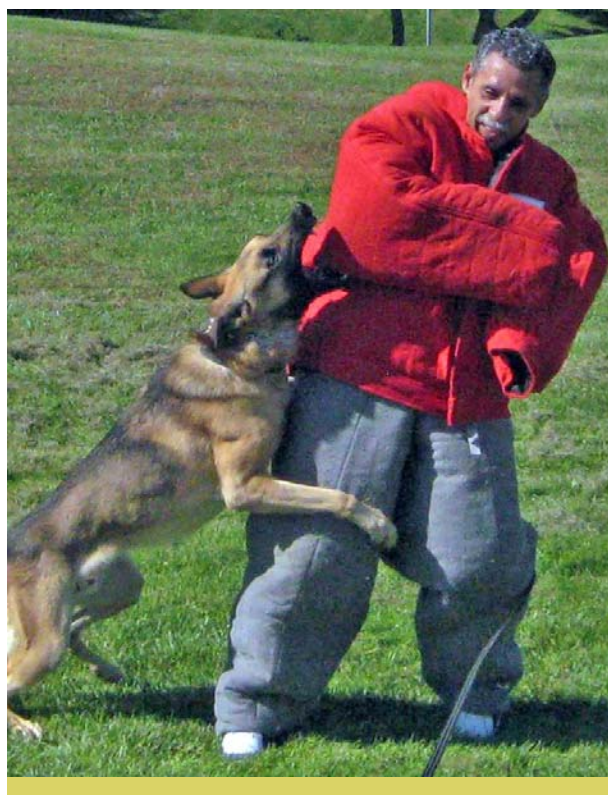
Who let the dog out?