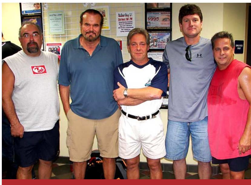
Meanwhile, back at the club...